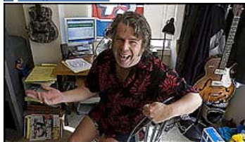
Mojo Nixon hosts "Outlaw Country" on Sirius from his San Diego bungalow.